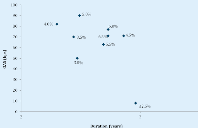
Bloomberg Barclays 30 Year Fixed Rate MBS Index, 4 by Coupon